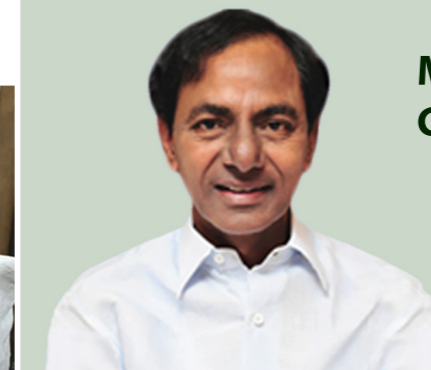
Sri K. Chandrashekar Rao Hon'ble Chief Minister

Municipal Administration & Urban Development Department, GOVERNMENT OF TELANGANA